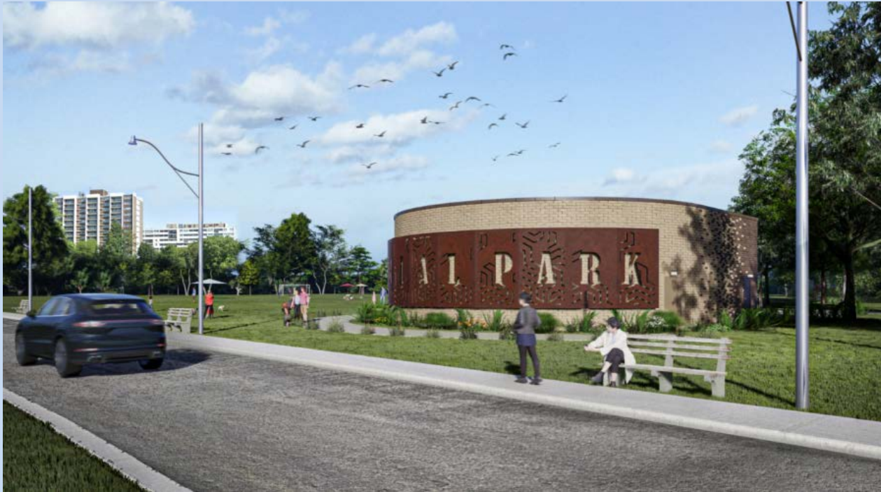
Rendering of planned surface building for pumping station