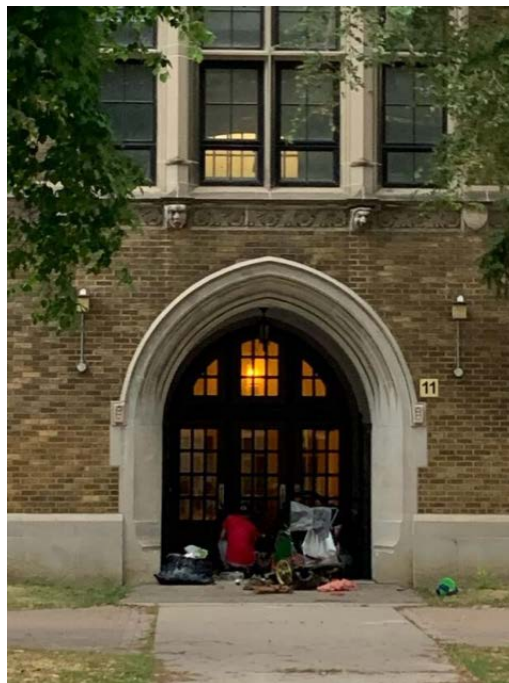
Taken outside Northern Secondary School