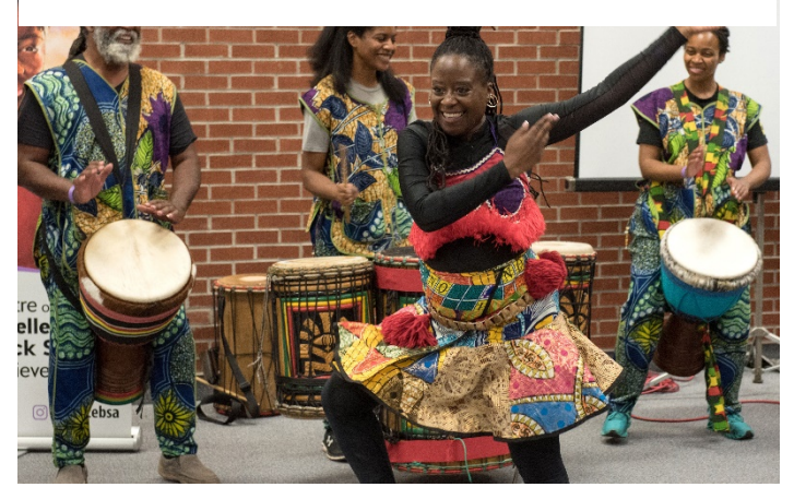
Performance from Coco Collective