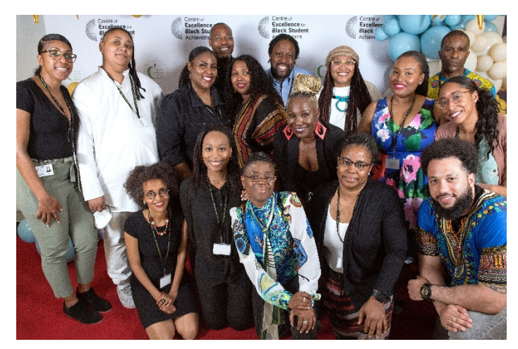
Group picture of staff from the Centre of Excellence for Black Student Achievement