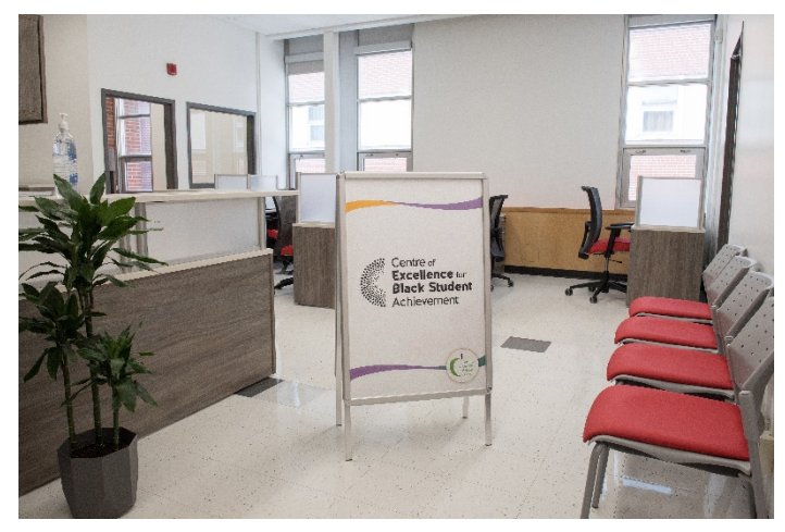
Office at the Centre of Excellence for Black Student Achievement