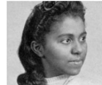
Marie Maynard Daly