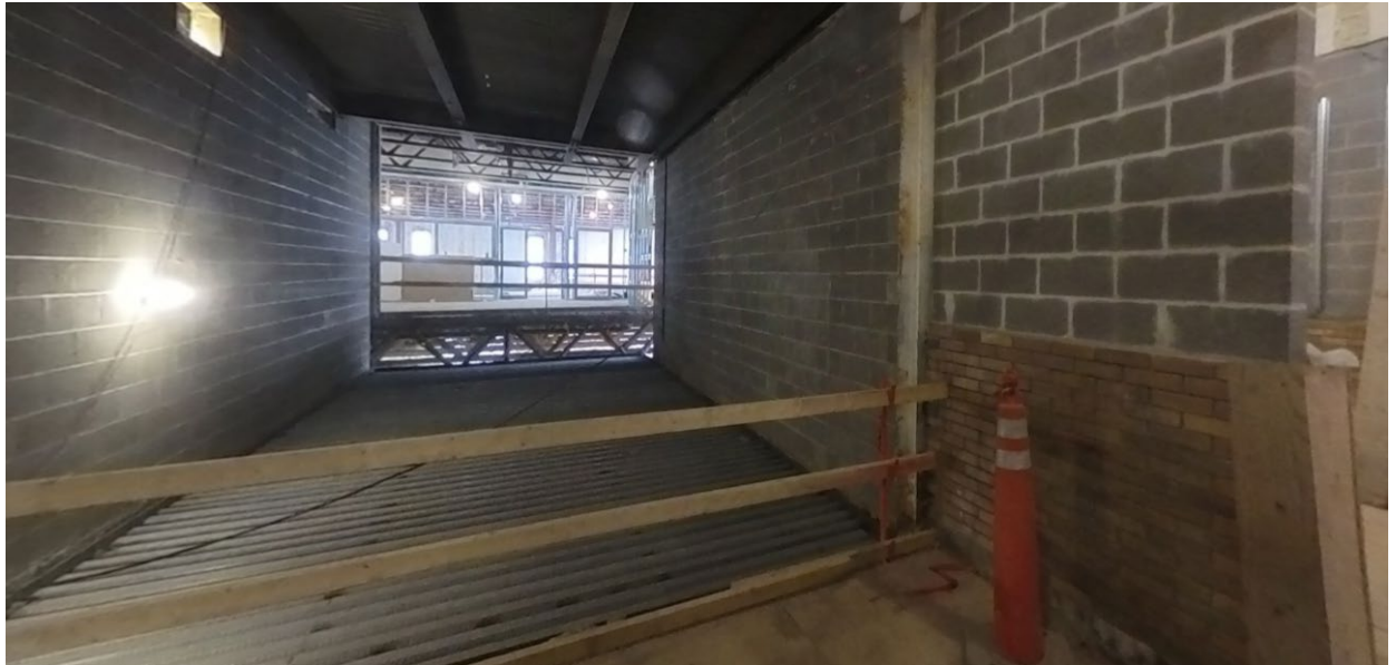
Zone A – Photo looking east into Zone B of new deck infill as preparation for new sloped floor and stair connection between Zones A and B.