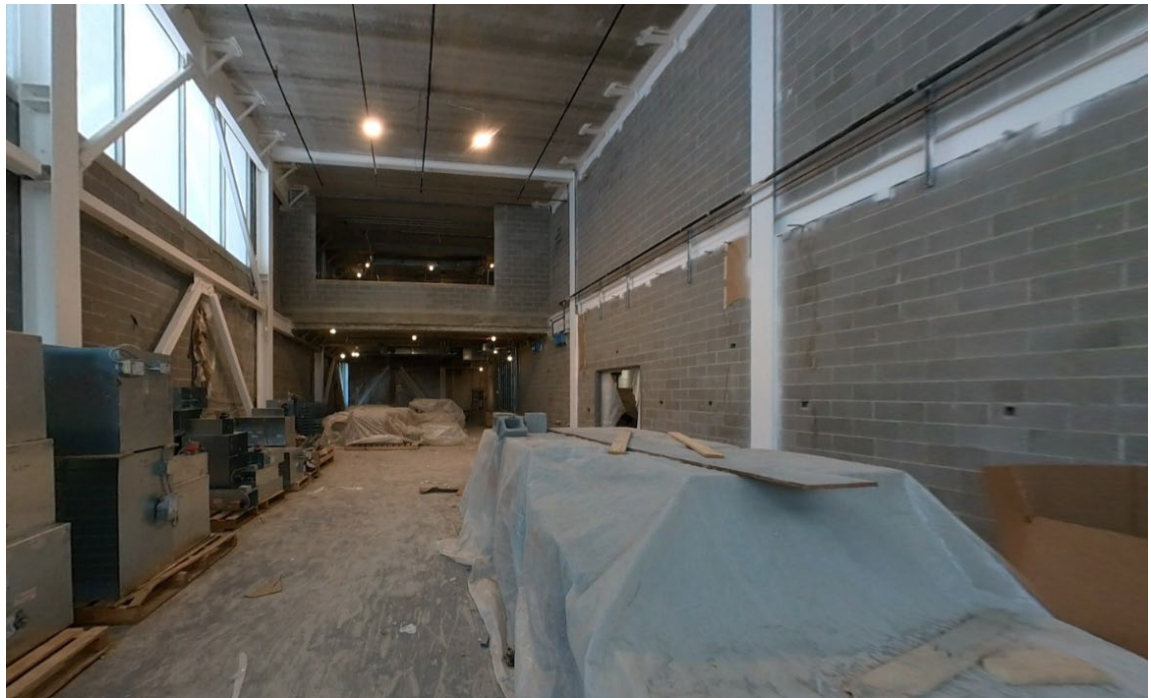
Zone C – Photo looking south through Construction program shop.