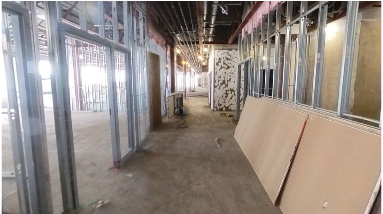
Zone B – Photo looking south through the third floor new steel studs and door frames.