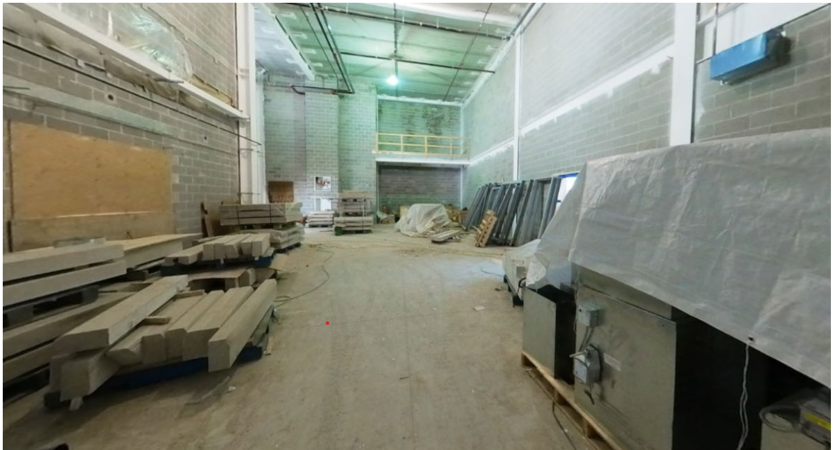
Zone C – Photo looking north through Automotive program shop.