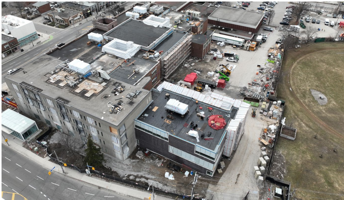
Zones A, B, and C – Photo looking west at school reconstruction.