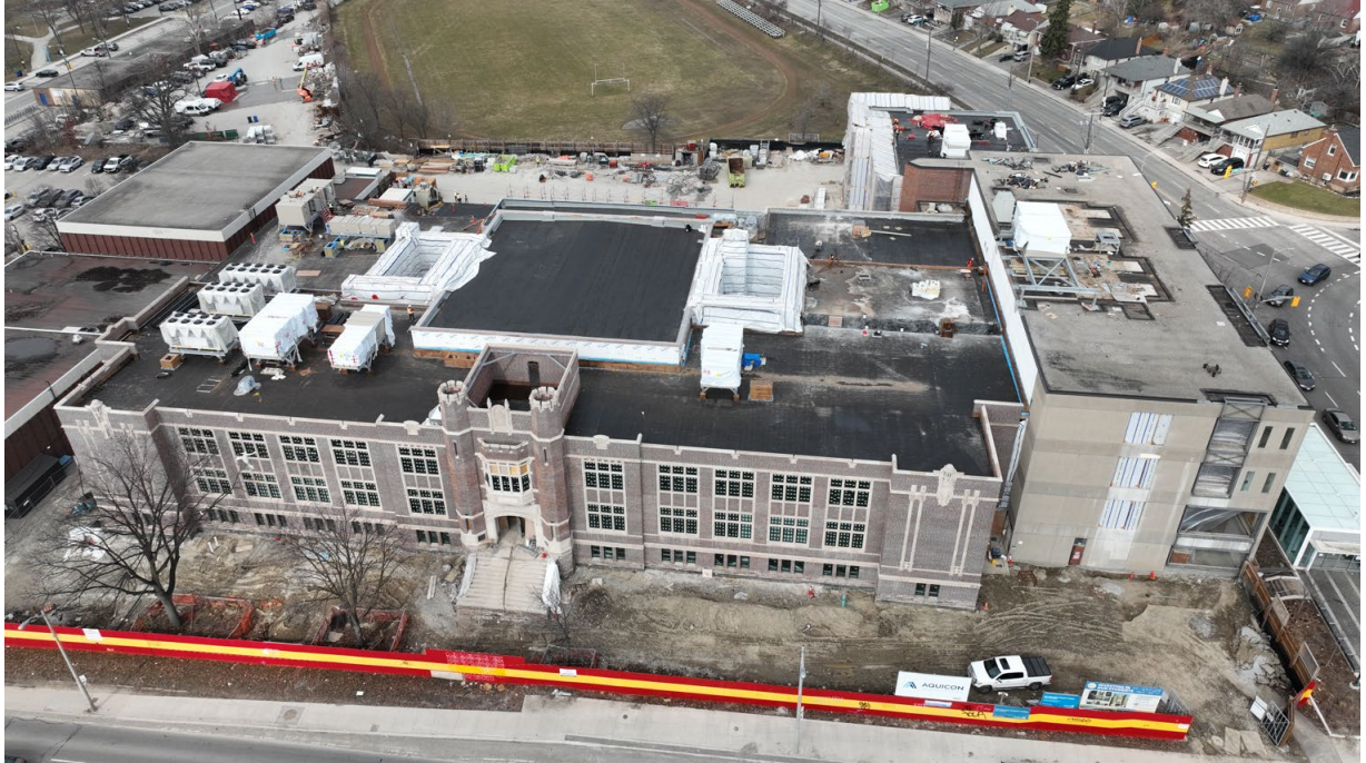
Zones A, B, and C – Photo looking North at school reconstruction.