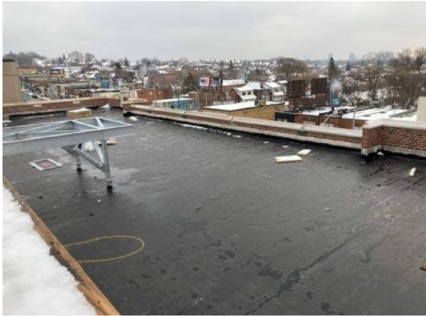
Zone A – Photo looking south-east of ongoing roofing and mechanical equipment installation preparation.