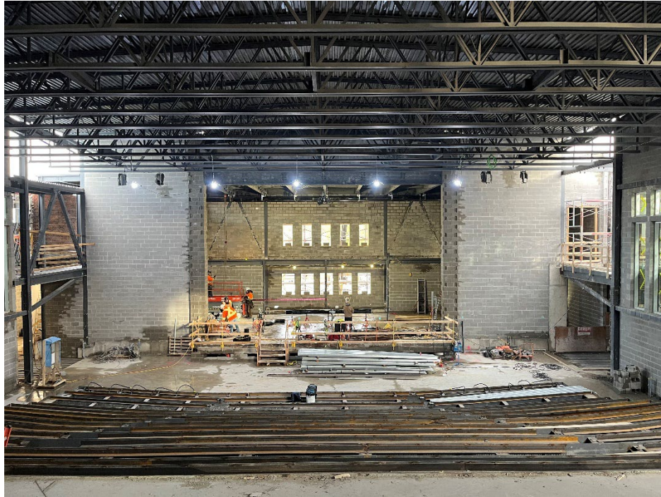
Zone A – Photo looking north through auditorium reconstruction, November 2025