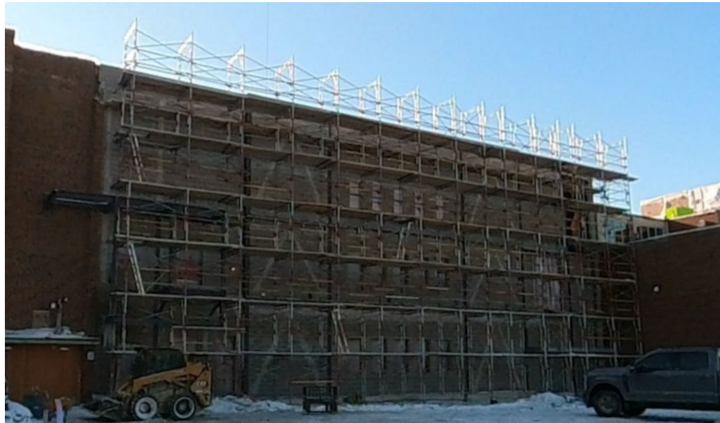
Zone A – Photo looking south at reconstructed auditorium north-facing wall