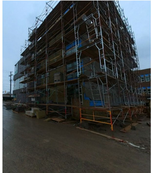
Zone C – Photos looking south-west and south-east of new façade and building enclosure reconstruction, with new windows.