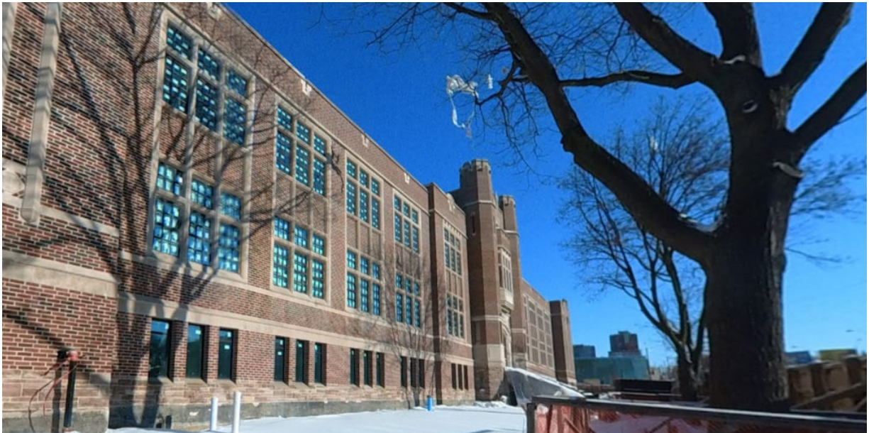
Zone A – Photo looking east at school reconstructed south façade and new windows