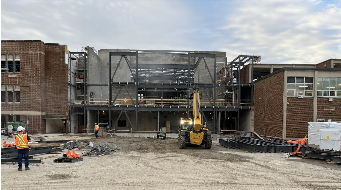
Zone A – Photo from new auditorium stage looking south