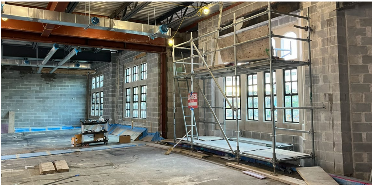
Zone A - Interior photo looking southeast showing steel sash window installation