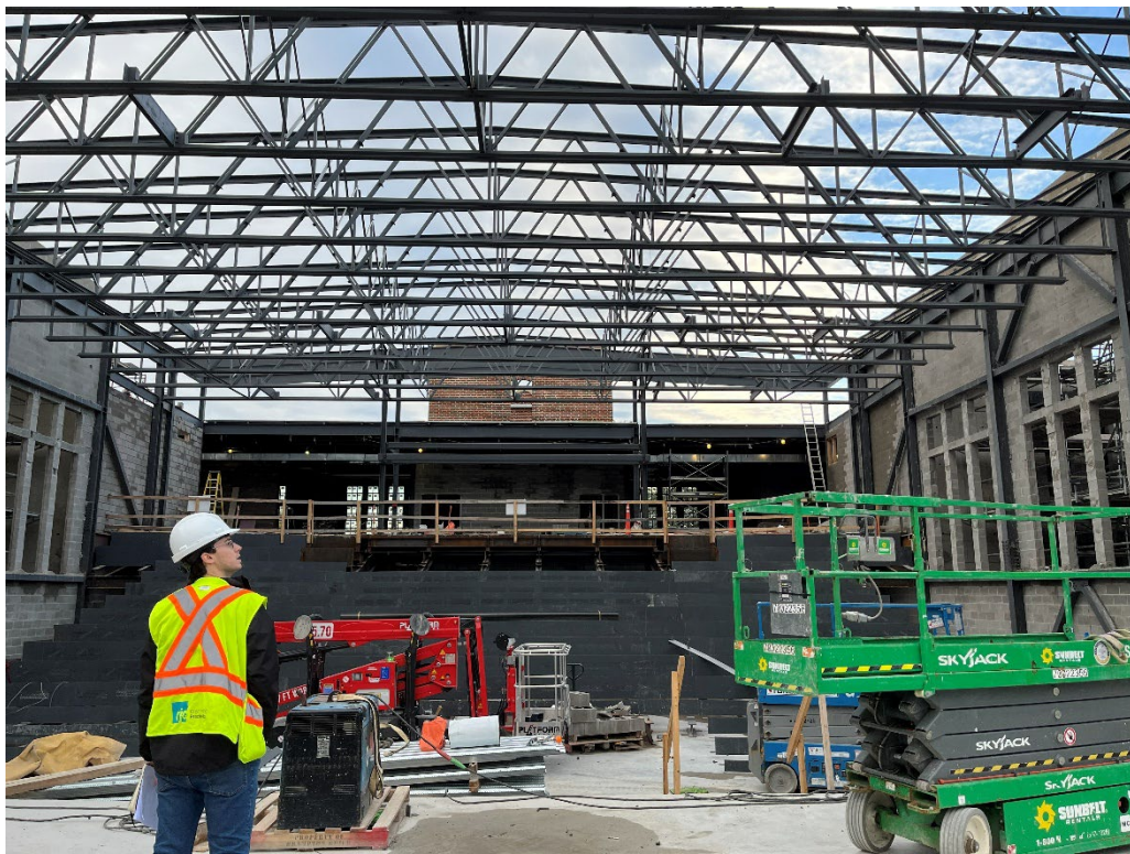
Zone A – Photo from new auditorium stage looking south