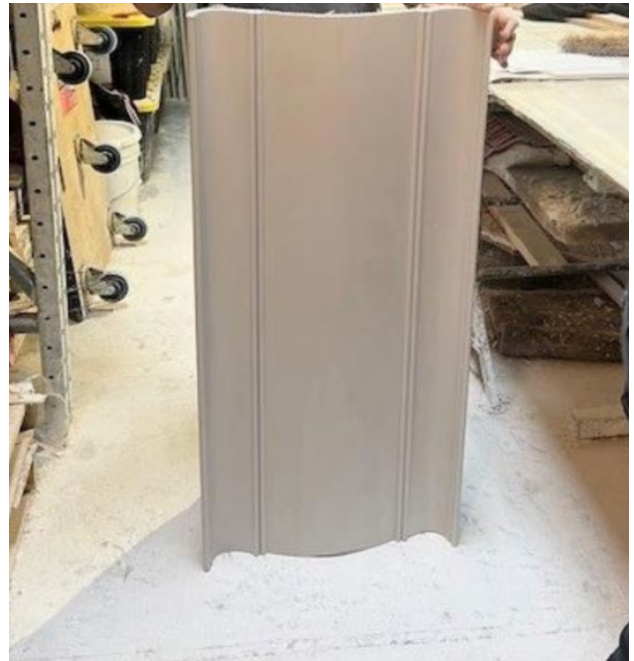
Zone A – Photos of sample proscenium plaster plaque and 4-foot run