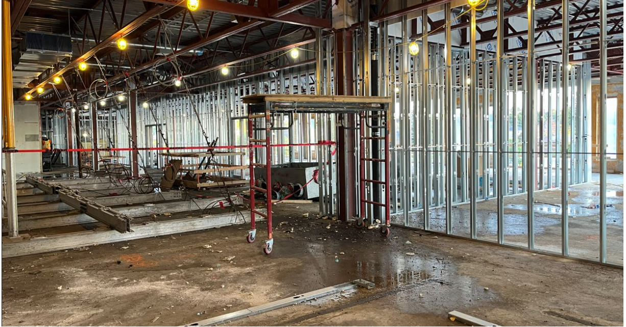
Zone B – Photo of structural bracing and new steel stud installation.