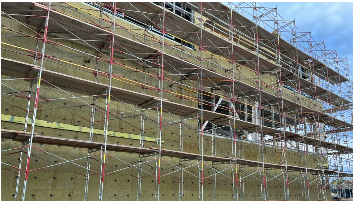
Zone C – Photo looking northwest of building envelope assembly with stone anchors