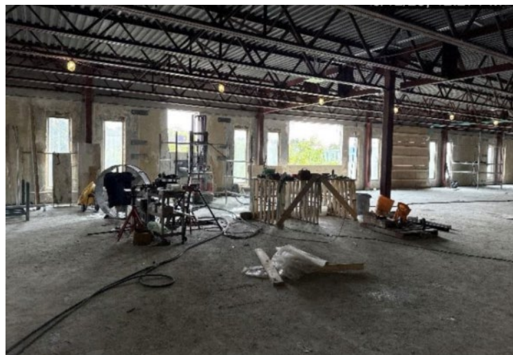
Pre-cast panel removal – ZONE B