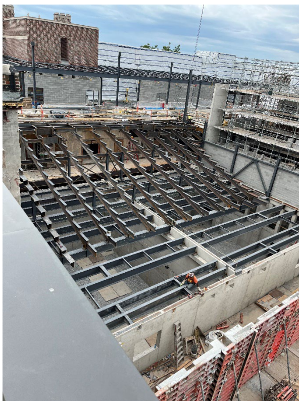
An overview of the auditorium steel installation – ZONE A