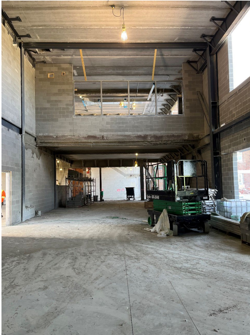
Interior block walls, window frame, mechanical routing, and electrical routing install in progress – ZONE C