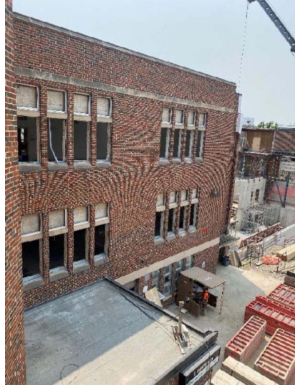
Window removals in progress to accommodate new operable windows. – ZONE A