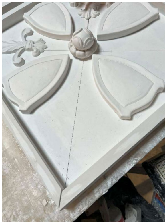
Plaster mock-up to be installed in reconstructed auditorium – ZONE A