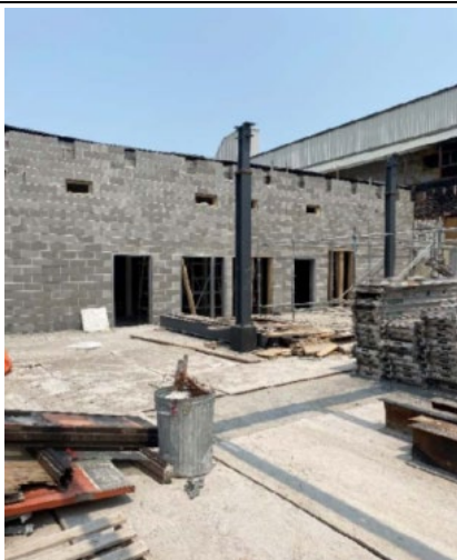
Third floor block wall reconstruction – ZONE A