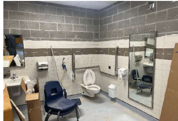
Interior photo of new universal barrier free washroom under construction on ground floor.