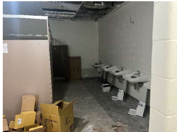
Interior photo looking to the east for the new of the new boys' washroom currently under construction on the second floor of the new addition.