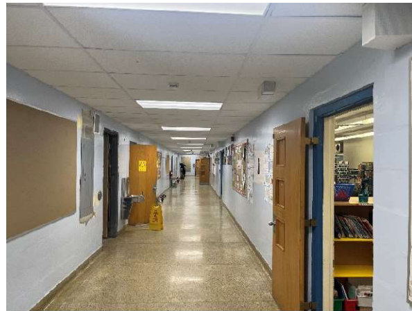
Interior photo of new ceiling grid, lighting and emergency lighting in ground floor corridor.