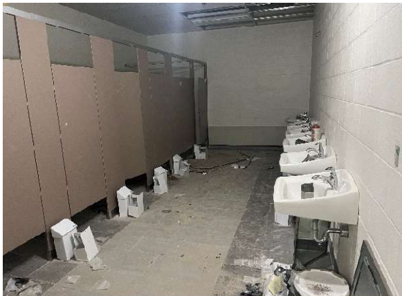
Interior photo looking to the east for the new of the new girls' washroom currently under construction on the second floor of the new addition.