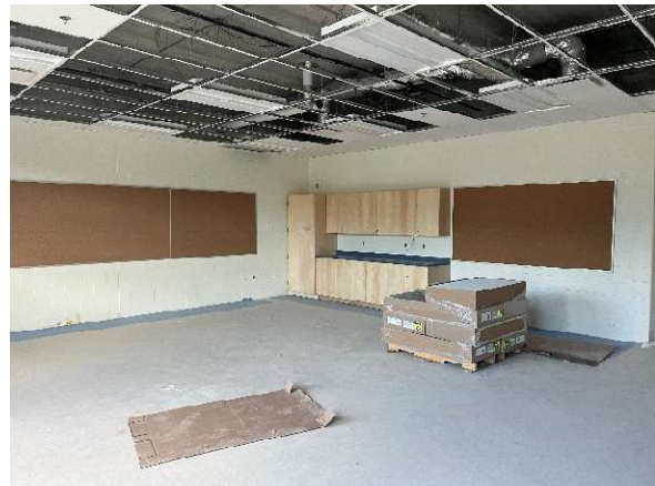
Interior photo of new classroom facing southeast currently under construction. Flooring, whiteboards/tac boards and millwork have been installed and room is ready for above ceiling inspections.