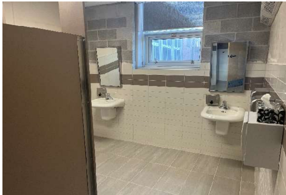
Interior photo of new staff washroom on second floor.