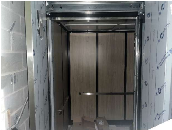
Interior picture of new elevator being installed in childcare/classroom wing.