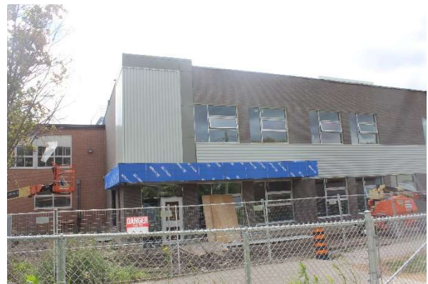
Exterior photo of the north elevation of the new childcare/classroom addition showing completed brick, metal panels, metal siding and windows.