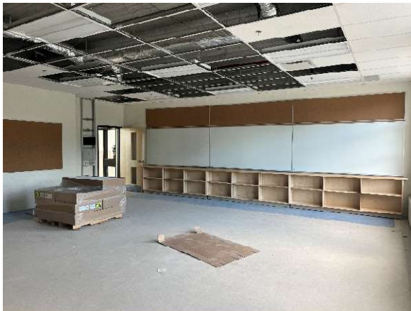
Interior photo of new classroom facing west currently under construction. Flooring, whiteboards/tac boards and millwork have been installed and room is ready for above ceiling inspections.