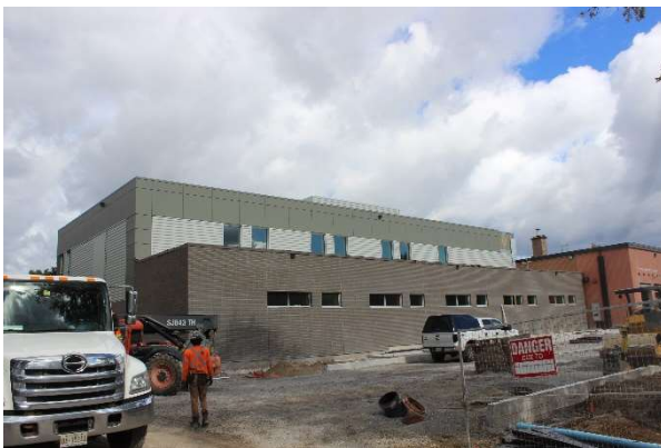
Exterior photo of the east elevation of the new gym addition showing completed brick, metal panels, metal siding and windows.