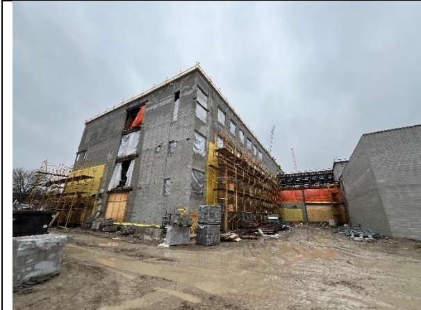
Picture taken from the South-West corner of the building looking at the Gymnasium. Curtain wall mullions have recently been installed. Roof on top of the gymnasium is also currently in progress.