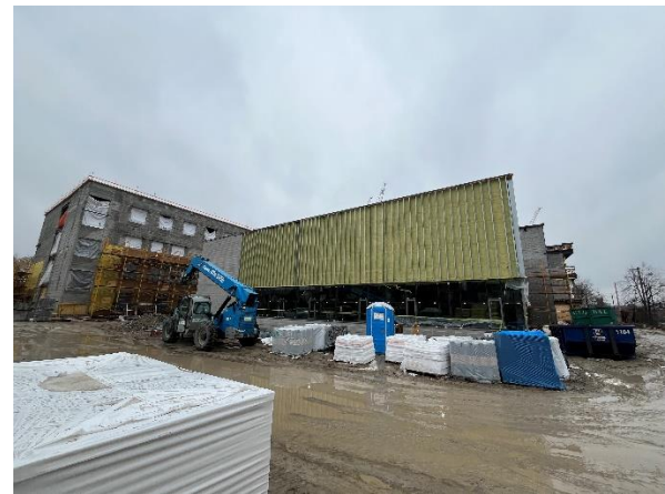
Exterior photo of the South-West corner of the building, looking at the gym. Spray foam insulation and curtain wall glazing was recently installed.