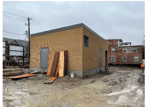
Picture of the transformer vault, located to the North-West of the new building. Roof membrane and parapet was recently installed.