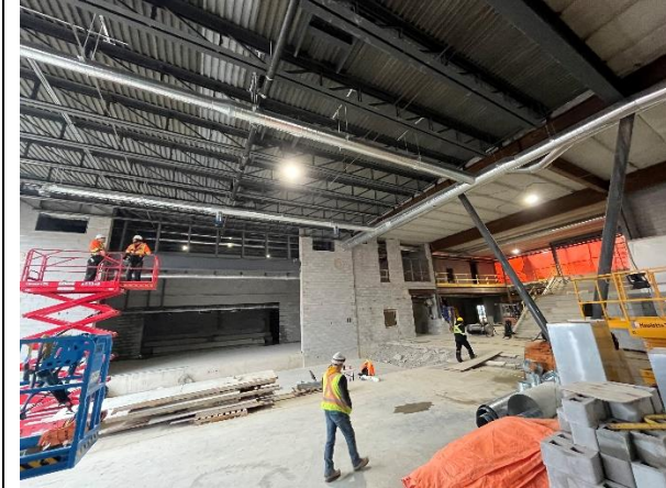
Picture of the student commons area looking at the stage and the main stair. Currently installing the exposed ductwork.