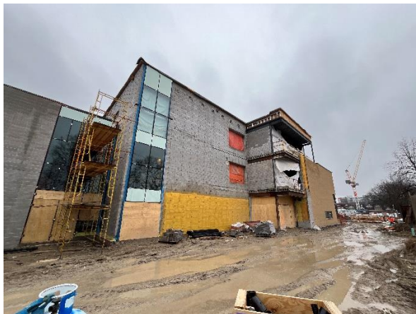
Exterior photo of the South main entrance. Exterior brick was completed in the past month. Spray foam insulation and curtain wall glazing was recently installed.