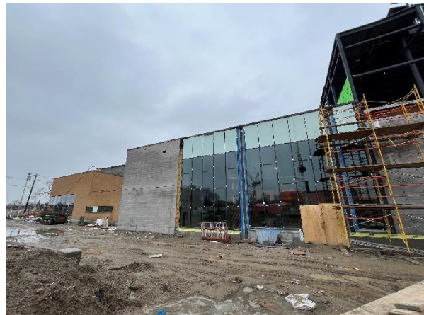
Exterior photo of the East side of the building looking towards the student commons area. Parapets have been built up, exterior block veneer and curtain wall glazing was recently installed.