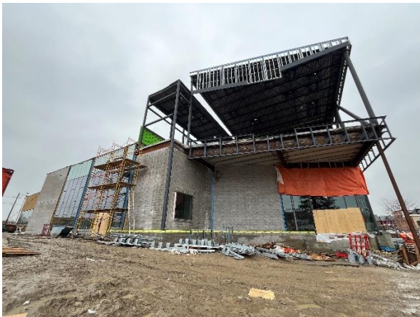
Exterior photo of the North-East corner looking at the North entrance. Third floor and roof structural steel and steel deck was completed in the past month. Exterior block veneer and curtain wall glazing was recently installed.