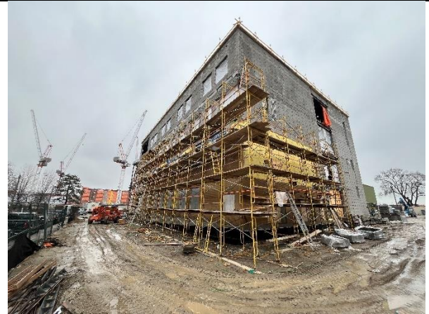
Picture taken from the West side of the building looking at the courtyard. Over the past couple of months, the fourth floor was built up. The spray foam insulation and exterior brick veneer is currently being installed.