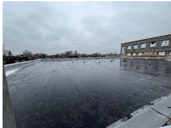
Picture of the gym roof. The parapets were recently built up and the roof vapor barrier membrane was installed.