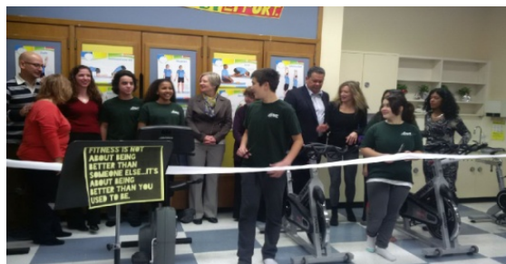
Ribbon cutting at Lanor Junior Middle School with Trustee City Councillor, Principal, Staff and Students

Congratulations to Lanor Junior Middle School on the Grand Opening of their Health and Wellness Room on December 2, 2014.