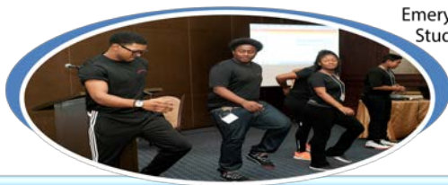
Emery CI and Thistletown CI Students lead the Physical Activity Break