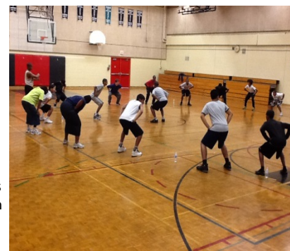
Thistletown CI Students Facilitate and Engage in the Exercise To Success Program

Community Professional Who Attends Regularly: "It's a grassroots way of everyone getting together. Some think youth are disengaged, not interested and apathetic, but when you go straight to the source, you get a very different picture. You get a picture of students wanting to get more involved....and this is a pretty strong foundation."