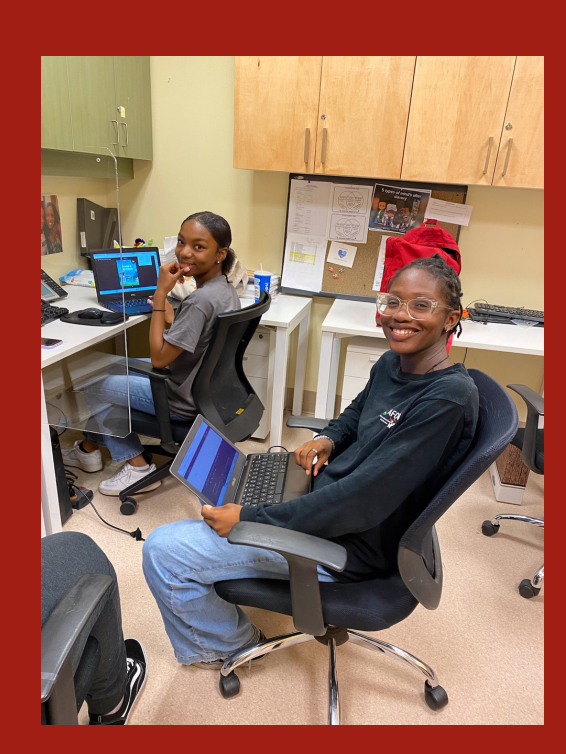
Junior leaders at TAIBU Community Health Centre