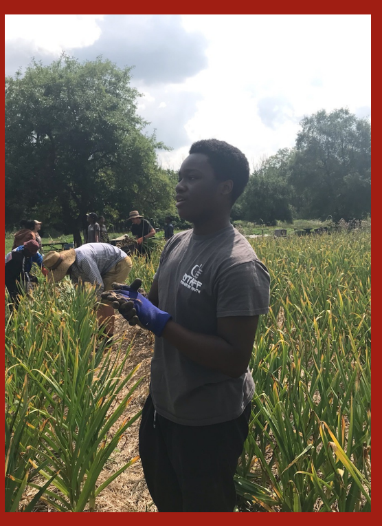
At Black Creek Community Farm doing land-based learning

Junior leaders began their placements and were welcomed by the community agencies. Each year of the Black Student Summer Leadership Program (BSSLP), we do our best to match students with experiential learning opportunities that align with their career goals and interests. For 2023, we have 20 experiential learning agencies offering placements.