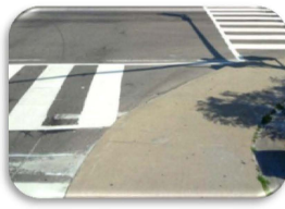
Enhanced Pedestrian Crosswalk Markings