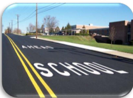
School Stencil Pavement Markings Speed Markings (Optional)