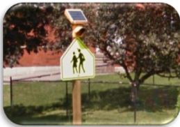
Flashing Beacon with Timer

As part of the City of Toronto’s Vision Zero Road Safety Plan , Transportation Services will be creating School Safety Zones around 20 Toronto schools per year, for the next five years. These School Safety Zones will introduce “gateway” features to help increase the visibility of the school zone with the goal of calming traffic. The features that will be installed will be site-dependent and determined by Transportation Services, but may include: