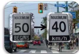
Speed Reductions (Optional)