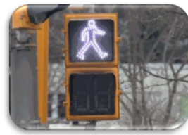
Increased Pedestrian Walk Times and Advanced Green for Pedestrians (Optional)