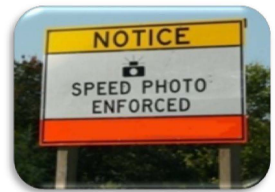
Automated Speed Enforcement (FUTURE) (Optional)