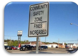
Designation as Community Safety Zones (Optional)