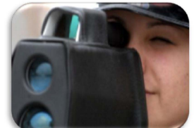
Data Driven Enforcement